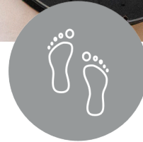
PCR with low footprint

Take a look at G4, a 100% post-consumer recycled (PCR) material with an extremely low CO 2 footprint