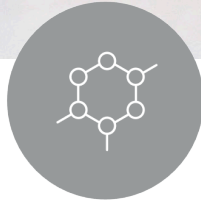
Compound made of Biopolymer with added recycled raw material